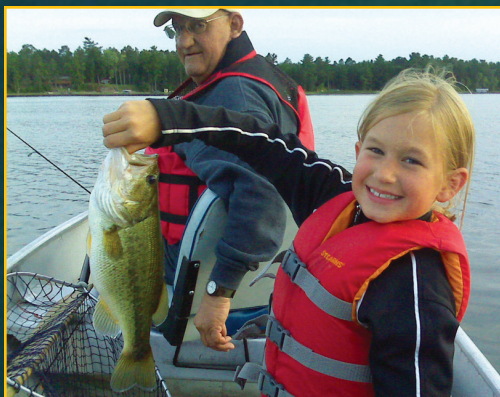
Lake Belle Taine abounds with walleye, muskie, bass and panfish.