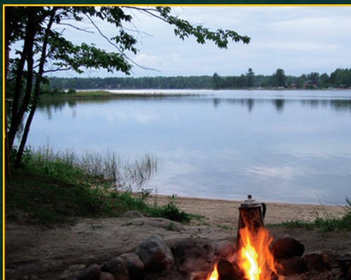
Savor the tranquility of large, secluded, wooded campsites.