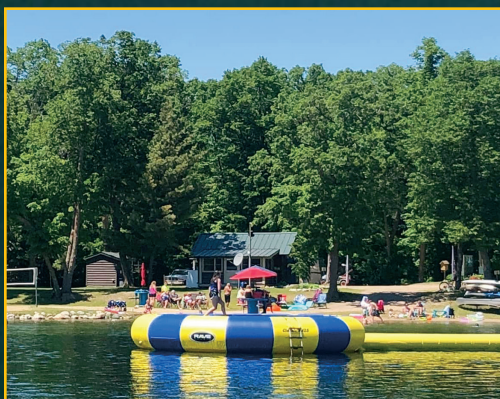
Sun, swim and relax on our sugar-sand main beach.